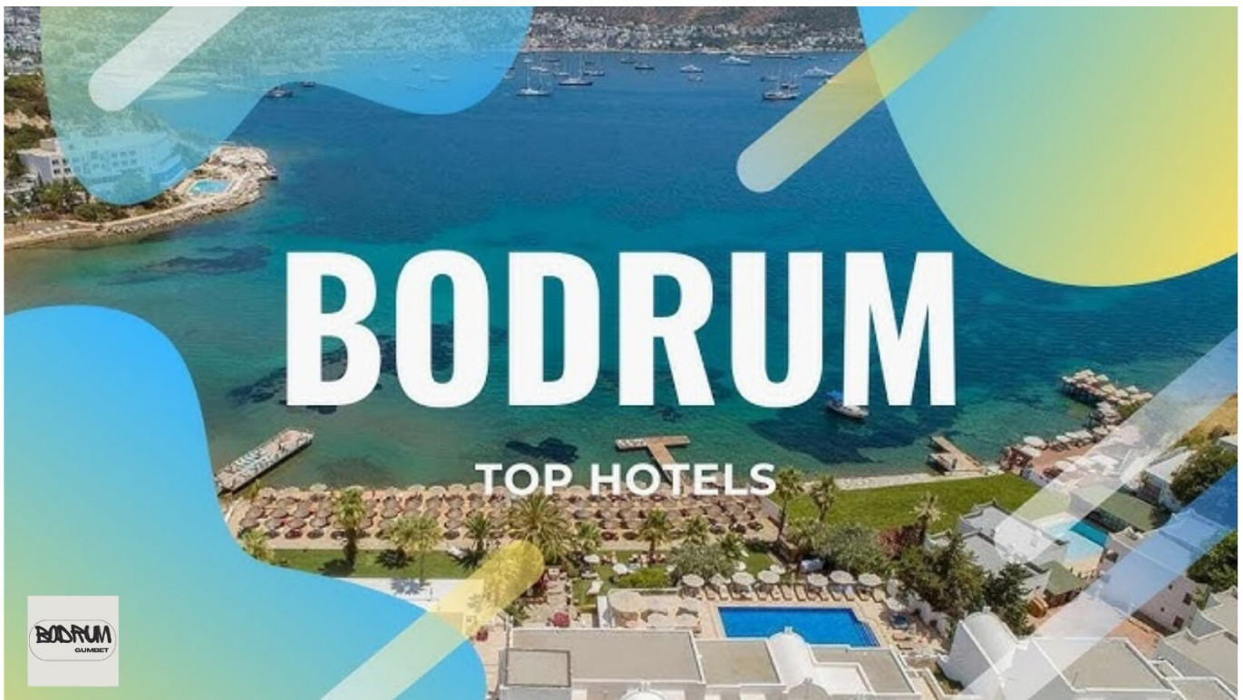
Best Bodrum Hotels