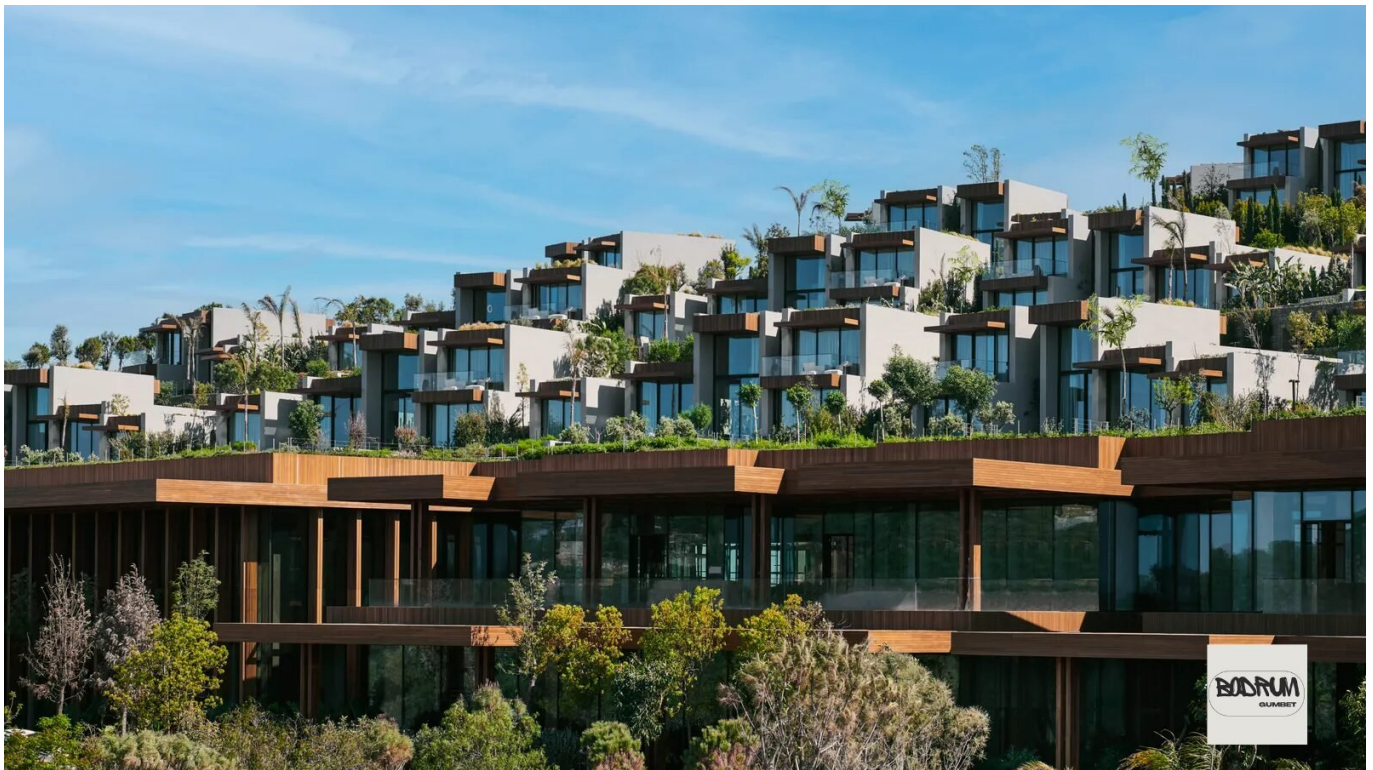
Maxx Royal Bodrum

hotel combines everything great from their other hotels into one luxurious spot.