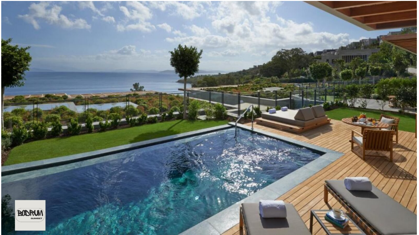
Mandarin Oriental, Bodrum

The Mandarin Oriental has everything you could want. There are two gorgeous beaches, a fun kids' club, and many tasty restaurants to choose from. If you're in the mood for shopping, you can check out the hotel's stylish boutiques. And if you're looking to relax, the health spa, connected with the Mayo Clinic, will take great care of you.