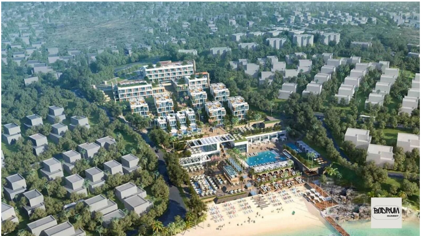
The Bodrum EDITION

affiliated with Marriott International, a large hotel chain company.