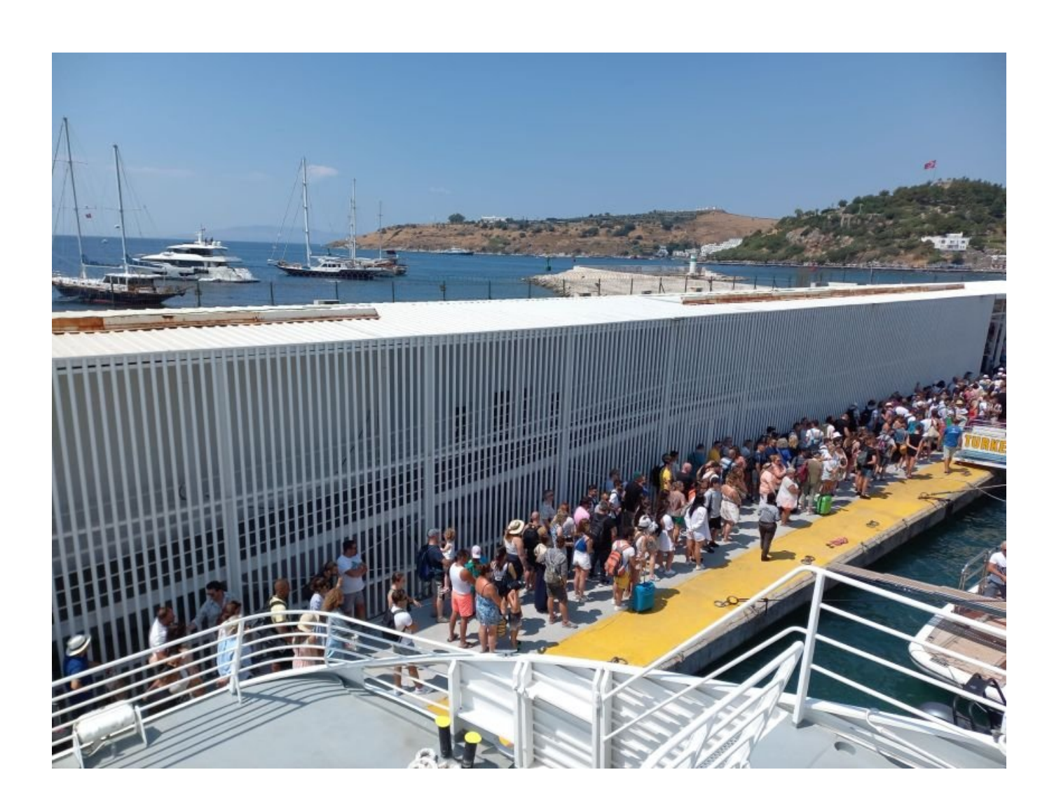
Option 1: Conventional Ferry